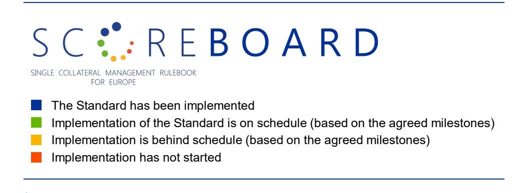
Table 1 Compliance level with the standards by each entity type