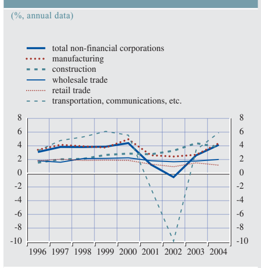
Chart B5.2 Debt-to-total assets ratio across non-financial corporate sectors