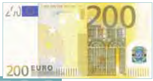
In 2009 all ECB publications feature a motif taken from the €200 banknote.